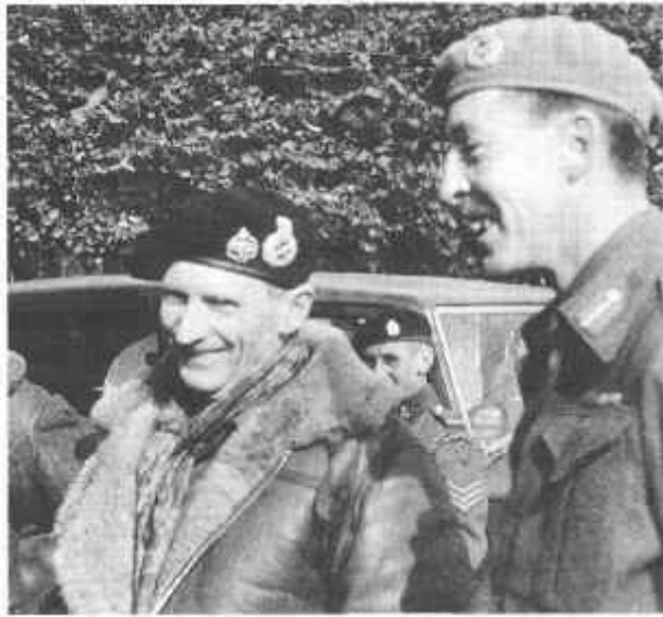
Major-General Dan Spry (right) talks with Field Marshal Montgomery at 3rd Canadian Infantry Division Headquarters on 24 October 1944.