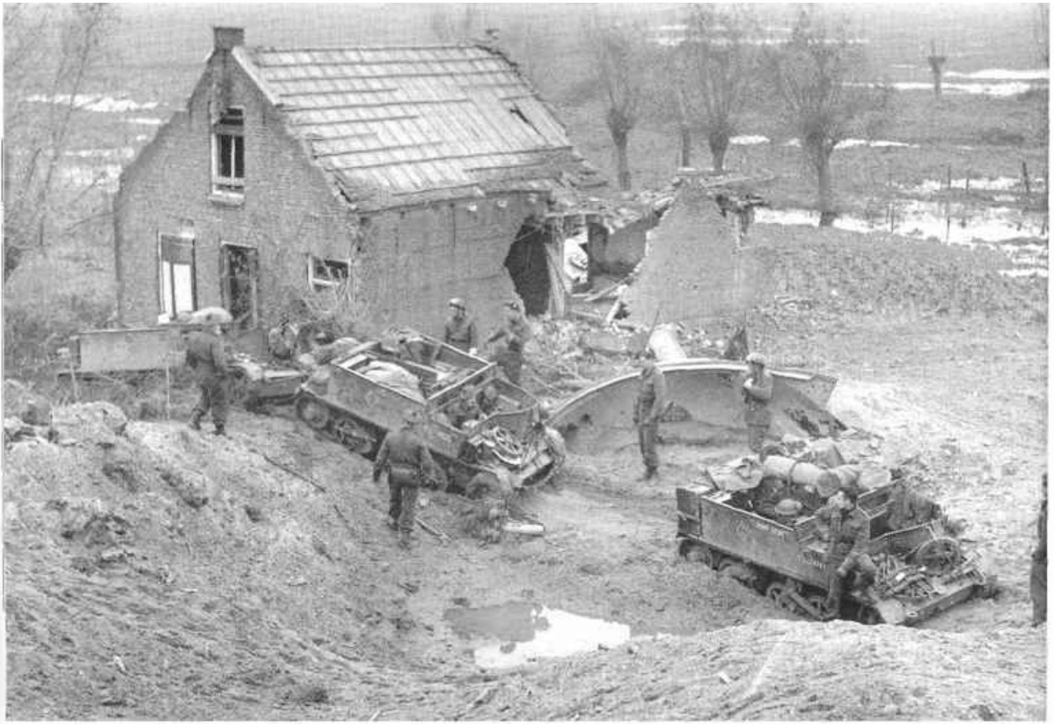
Canadian carriers move through the wet, muddy, flat ground near Breskens, 28 October 1944.