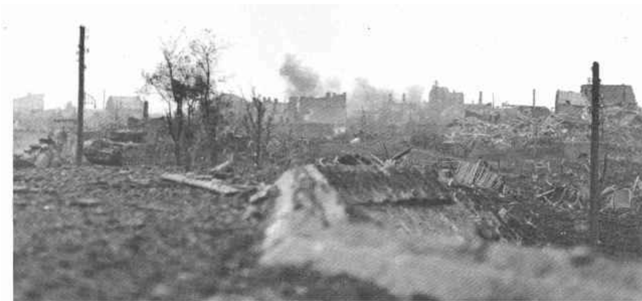
Artillery shells landing in Breskens, 22 October 1944. Note the Churchill AVKE at the left side of the photo.