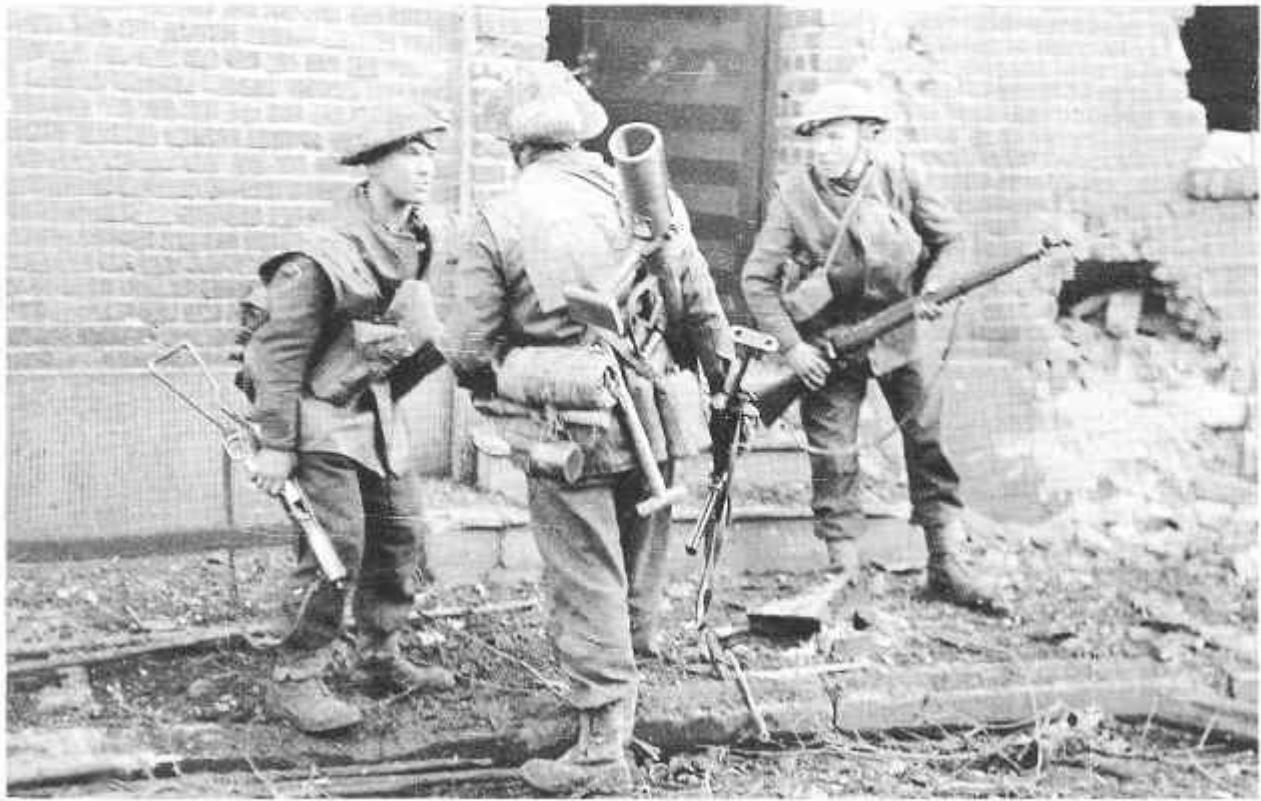
British infantry in Normandy had a wide array of weapons available to them including the Stengun (left, centre), PLAT (centre) and the Lee-Enfield rifle (right).

Then on 16 June, D+10 we did Cristot. Before I describe that, I should just explain that this will be the sixth or seventh time I've revisited the Normandy battlefields, or some of them, but after 42 years memory has faltered. The physical scene has gradually changed a good deal during that time, some of one's recollections have become blurred and distorted. I can't even remember from which direction we attacked Cristot. But worse than that, and especially applicable to Cristot, the Bocage country is a map reader's nightmare and the maps we had weren't, anyhow, very good.