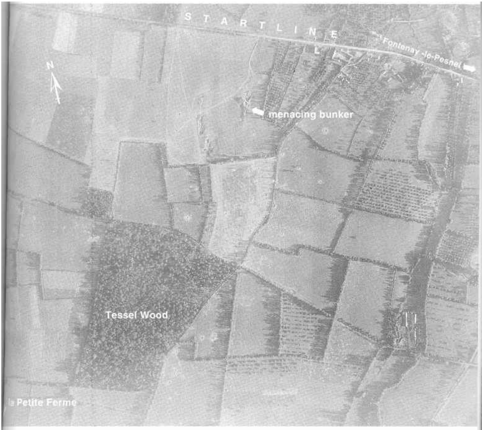
Tessel Wood and the startline of the 1/4 KOYLI attack.