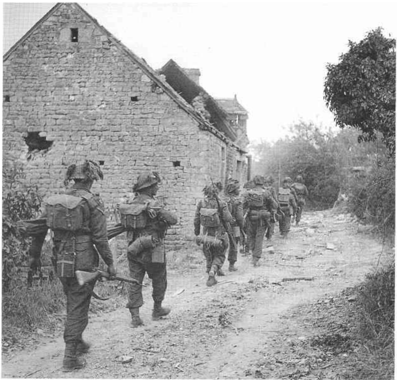
Soldiers of the Hallamshire Battalion walking through the village of Fontenay-le-Pesnel, 25 June 1944.

overwhelmed and got the rear platoon organised to counter-attack if this happened, but eventually it all died down. The enemy retired, leaving two knocked out tanks and quite a lot of dead. I was sure they'd be back and stood to the whole Company all night so that there'd be no question of surprise. But they didn't come. Did I do right?