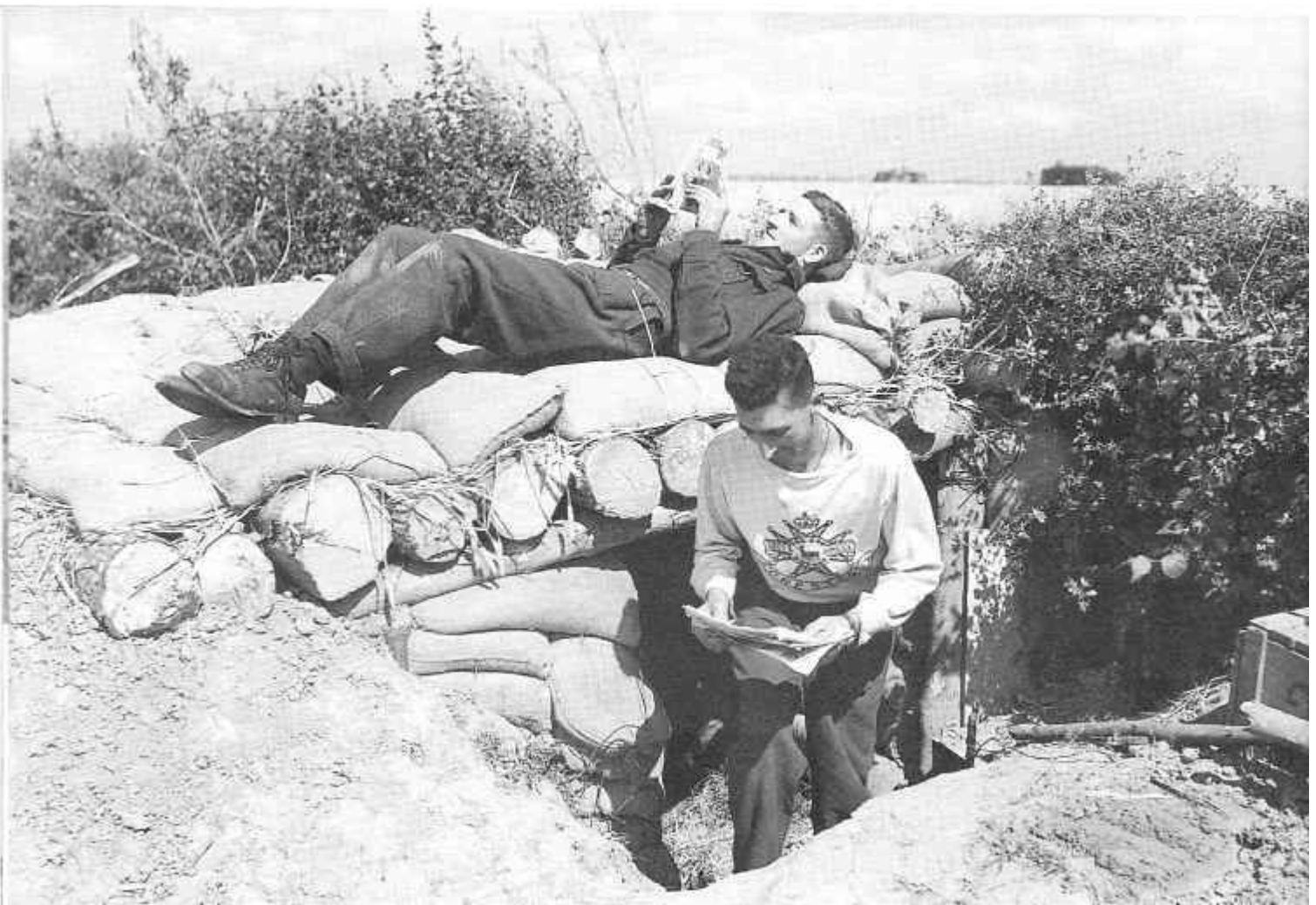
Two airmen from 143 Wing rest by their sturdy bunker as they await the return of the Typhoon which is their special care.