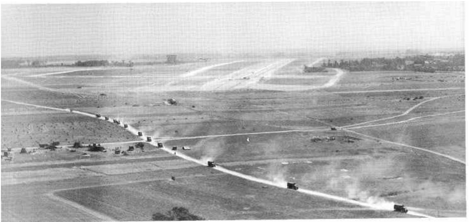
Above: An aerial view of an Allied landing field near Caen, 31 July 1944. Though it is broad daylight, the Allied convoy in the picture has complete freedom of movement and does not have to worry about air attack. The Germans in Normandy did not enjoy such freedom.

"Landing on the Norman beachhead was an experience which none of them would forget for reasons quite apart from any historical significance. The landing strips were inches deep in dust and whenever aircraft landed or took off tremendous clouds of dust swirled up. The Spitfires were soon coated with dust while the pilots assumed an ashen pallor and, in their greyish-blue uniforms, looked like grey ghosts. When the rain fell, as it so often did during the summer months, the runways became stretches of sticky mud which suggested the name 'Flounders Field.'" [RCAF Overseas: The Fifth Year , p.233]