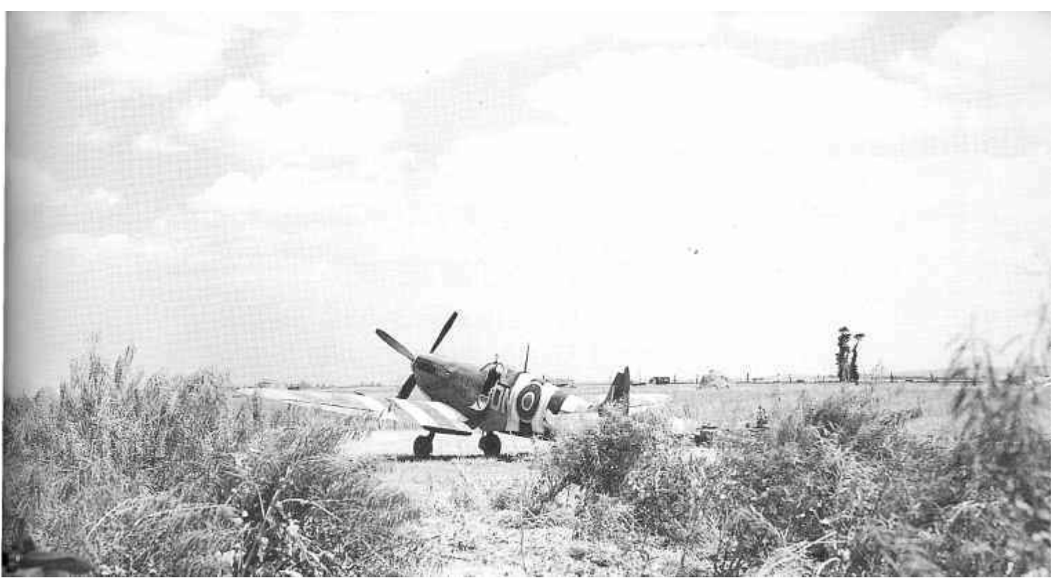
Nestled in a French wheatfield is a Spitfire from 416 Squadron. The pastoral surroundings of this aircraft at B.2 are a far cry from the combat it faced over enemy lines.

"The airstrip the Royal Engineers had cut out for us at B.8 lay to the northeast of Bayeux at Mangy, about 3 miles from the outskirts of the legendary Norman city. B.8 was a single strip running east to west to accommodate the prevailing winds. The