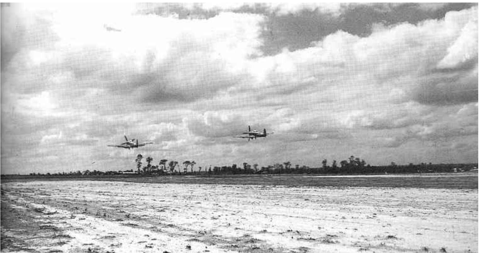
Stripped of their bombs, two RCAF Typhoons take-off into the twilight to continue their attacks against the German lines of communication.