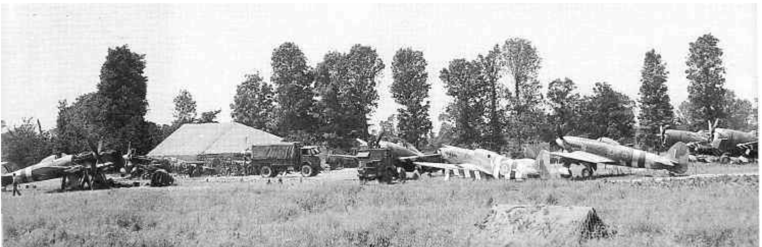
Below: The aircraft dispersal at the 419 Repair and Salvage Unit in June 1944. The role of this Canadian unit was to provide additional technical support to the squadrons of 143 and 144 Wings RCAF. Aircraft visible in the photo include (from left to right) A Typhoon, Spitfire, Thunderbolt, Mustang, Typhoon and two Thunderbolts.