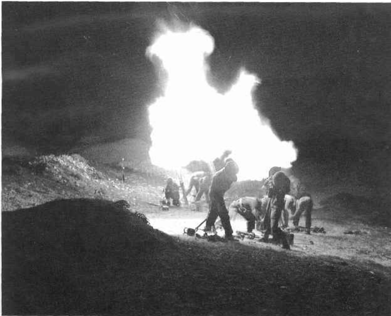
Mortars of I Canadian Corps firing at night, 6 April 1944.

company of the Westminster, reached the Melfa in mid-afternoon and formed a bridgehead by nightfall. [See "Battle for the Melfa River" on page 33 for a full description of this action.] Eleven Brigade passed through the following morning and, although its movement stalled during the day, it was able to get patrols across the Liri into Ceprano during the night. It was a good beginning for the Canadian Corps and 5th CAD. As one historian observed, after its first day of fighting as a formation, "The Canadian Corps was thus up to, and in one place over, the Melfa by the end of the day, and had every reason to be satisfied with their success. It was the first time that the 5 (Canadian) Armoured Division had been employed in the classic breakthrough role in