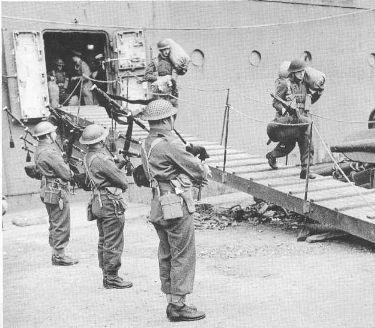
Troops of the Cape Breton Highlanders being piped off the ship upon their arrival in Italy, 8 November 1943.