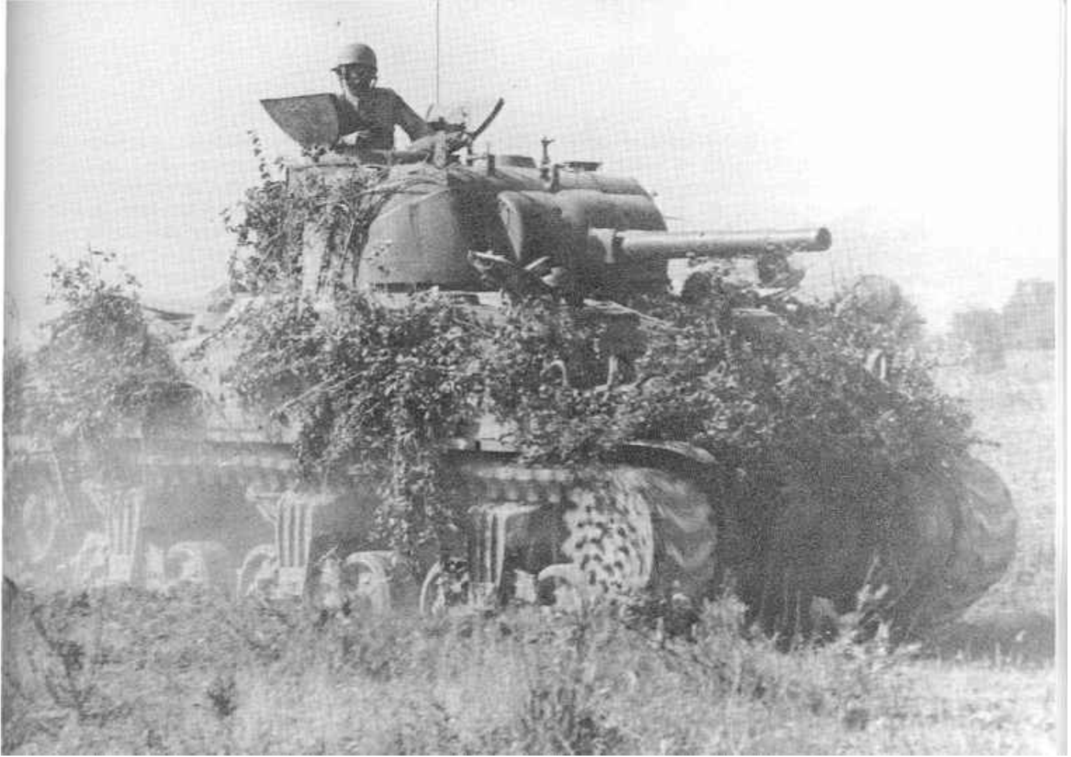
A Sherman tank of the Second Armoured Regiment (Lord Strathcona's Horse (RC)).

Following that the troops, units and formations had to be trained to execute them.