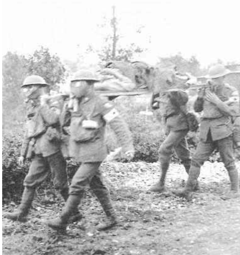
Top: German prisoners wearing gas masks march to rear carrying wounded while British tanks advance to the front.