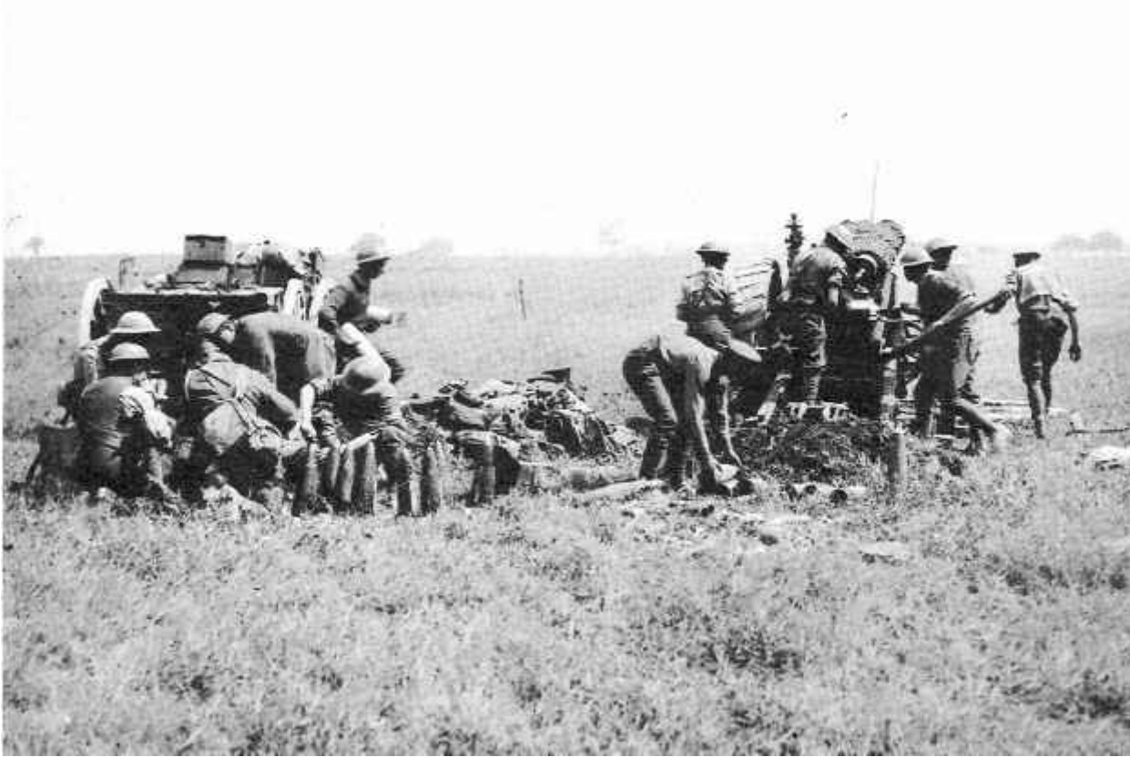
A 60-pounder in action at Amiens.