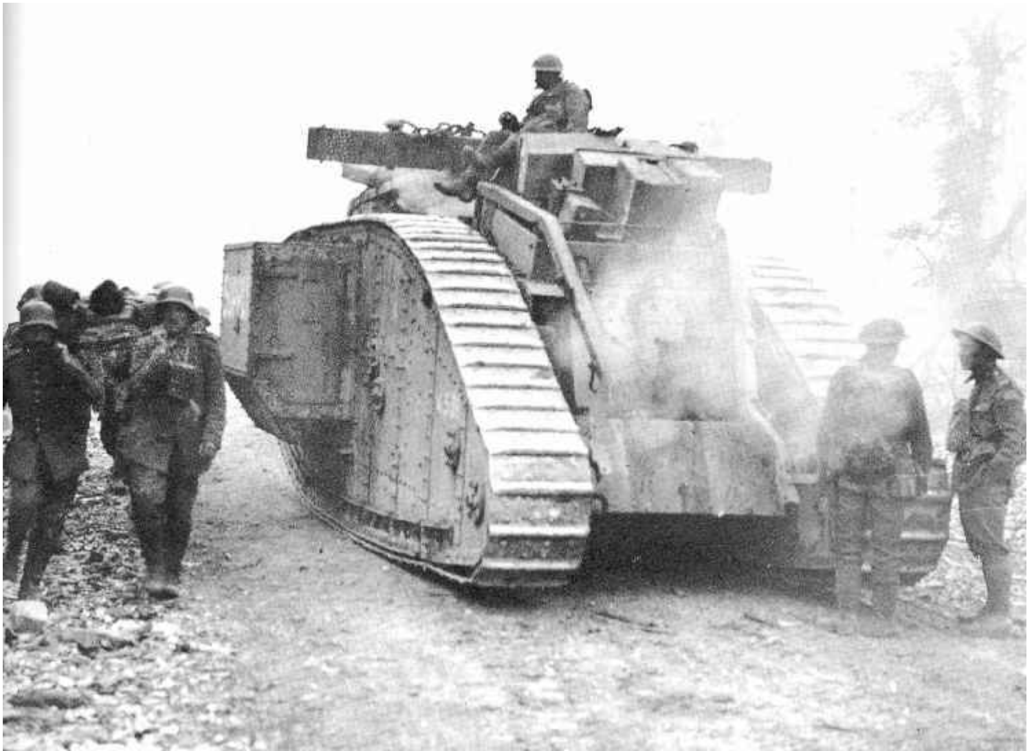
A Mark V tank advances down the Amiens-Roye road and passes German prisoners being sent to the rear.

this was the first battle test of the new model, much improved from its predecessor. The tank attack was a great success, taking all of its limited aims and managing to get all but three of the Mk Vs to their final objectives, with only one of these lost due to enemy fire. 4