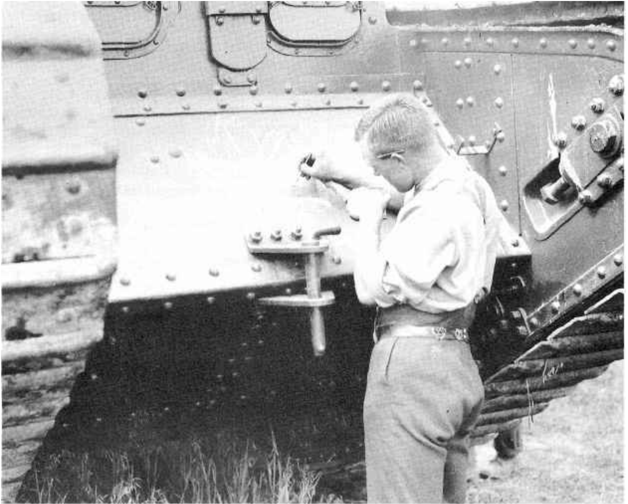
A Canadian-commanded tank having its war crest painted on before the Battle of Amiens.

Despite all of these difficulties Amiens was the most successful Allied operation of the