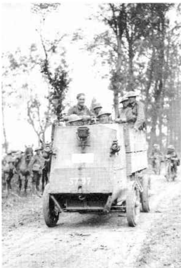
A Canadian armoured car, part of the Canadian Independent Force, going into action at Amiens.

Another formation of the Corps was also instrumental in aiding the advance, particularly in the early phases — the engineers. These troops played their most vital role on the 3rd Division's front, where the Luce flowed most heavily across the Canadian area of attack. At one point the river and accompanying wet marshy ground was more than 200 yards wide. The attacking troops held off the enemy while the engineers constructed footbridges across the river for the infantry. In several other areas where the Luce cut the front the engineers proved to be of equal value and thus made the crossing of this very difficult obstacle look relatively easy. 32