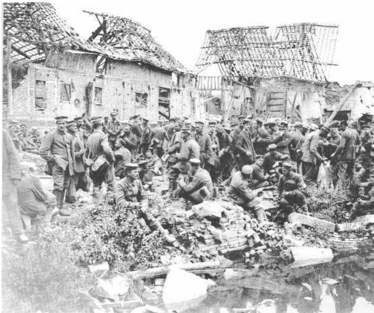
Germans captured by the Canadians at Amiens. The capture of so many prisoners was unprecedented on the Western Front. (NAC PA 2858)

The Canadian Corps possessed infantry of a very high calibre, and although there remained problems in integrating new methods into the existing system, Canadian infantrymen stood up to their reputation at Amiens, demonstrating a great deal of bravery and skill, as the advance and the four Victoria Crosses awarded to their ranks on 8 August attest. 36 The large number of prisoners and guns captured for the day also attested to the infantry's skill, as tanks, cavalry and artillery units were not tasked or equipped for the capture and holding of prisoners. The advance, in all phases, depended on an infantry willing to push on often under very difficult circumstances. The troops were certainly given extra drive by their great advance, as several first hand accounts spoke of the elation felt by all at such an advance after so many years of static warfare. 37 The valour of the infantry was especially evident in the advance from the red to blue dotted lines, where they played a vital role in securing the latter objective, when