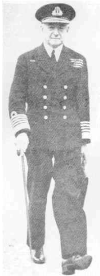
Admiral of the Fleet Sir Dudley Pound

especially in the early part of the war. The Royal Navy managed to get the British Army both to and from Norway without it, from Dunkirk while it was in dispute and from Greece with the Germans in absolute control of the air. Moreover despite the total air superiority which the Germans enjoyed in the eastern Mediterranean, not a single German soldier managed to get to Crete by sea. No doubt the