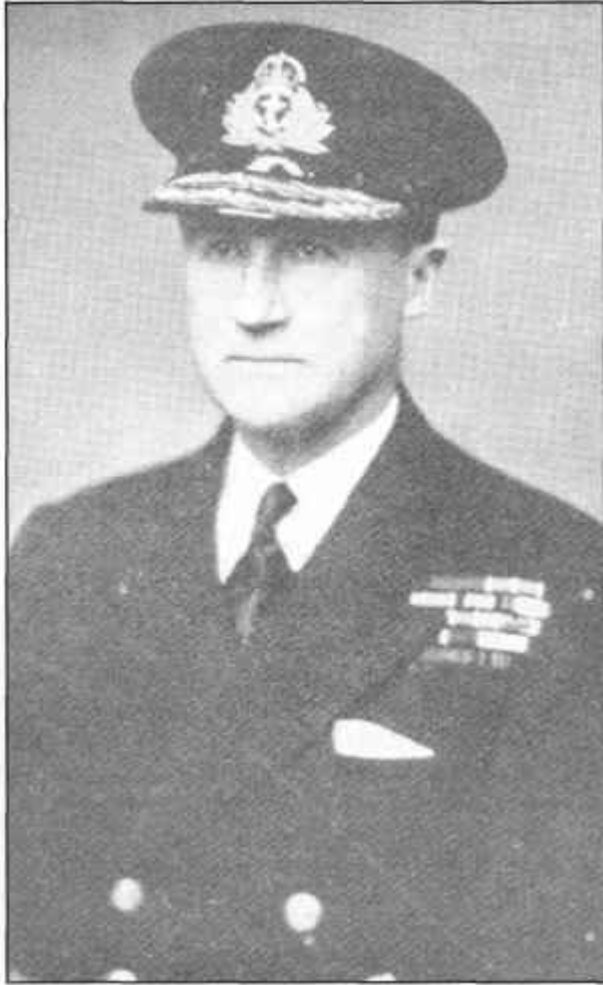
Admiral Sir Bertram Ramsay

able to play in that great maritime conflict was, in Barnett's view, the direct result of the failure to provide the Fleet with the kind of modern equipment which had become standard in the U.S. Navy.