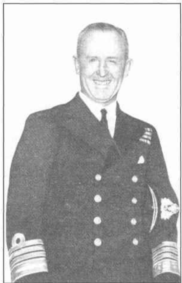
Admiral of the Fleet Sir Andrew Cunningham