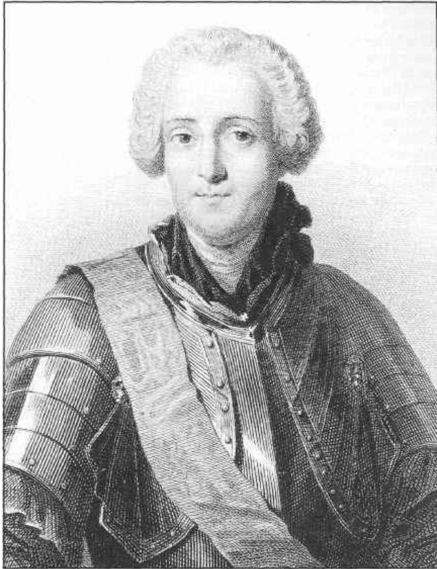
François de Lévis (painting by J. Parreau, NAC C34215)

British at Quebec, however, was more permeable than the wilderness separating New France and New England. Here, war was conducted in a settled agricultural region where a semblance of normal life continued under British military occupation. Indeed, following the capitulation of Quebec, a flourishing commerce had developed between the French and British zones. By 25 November, Murray was angrily aware "that the [British] merchants, ever greedy of gain, to purchase furs had transmitted a good deal of cash to Montreal." 16