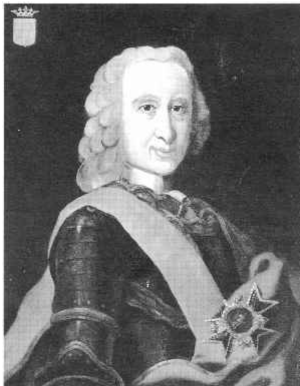
Pierre de Rigaud de Vaudreuil (Artist unknown, NAC CI 1243)

I n September of 1759, the residents of the government of Quebec found themselves under the rule of an occupying army. Out of a range of possible responses, from violent