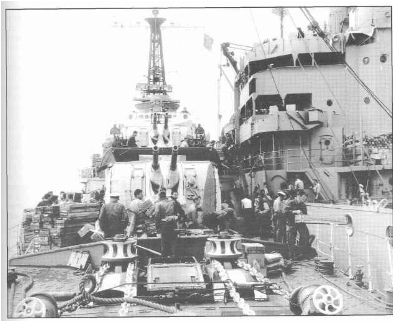
HMCS Nootka being resupplied by USS Virgo off the Korean coast Ice cream, steaks, ammo, etc.

Certainly, there was no doubt who was the junior in the relationship. With a population of just over ten million, most of its effective military forces in the United Kingdom and with more on the way there, Canada was a virtual supplicant, seeking the help of the 125 million-strong United States to defend its homeland in a world suddenly made unaccustomedly perilous. There was every sign of this in the negotiations over a strategic defence plan for the continent when the Americans proved to be as difficult to deal with as the British had ever been. The