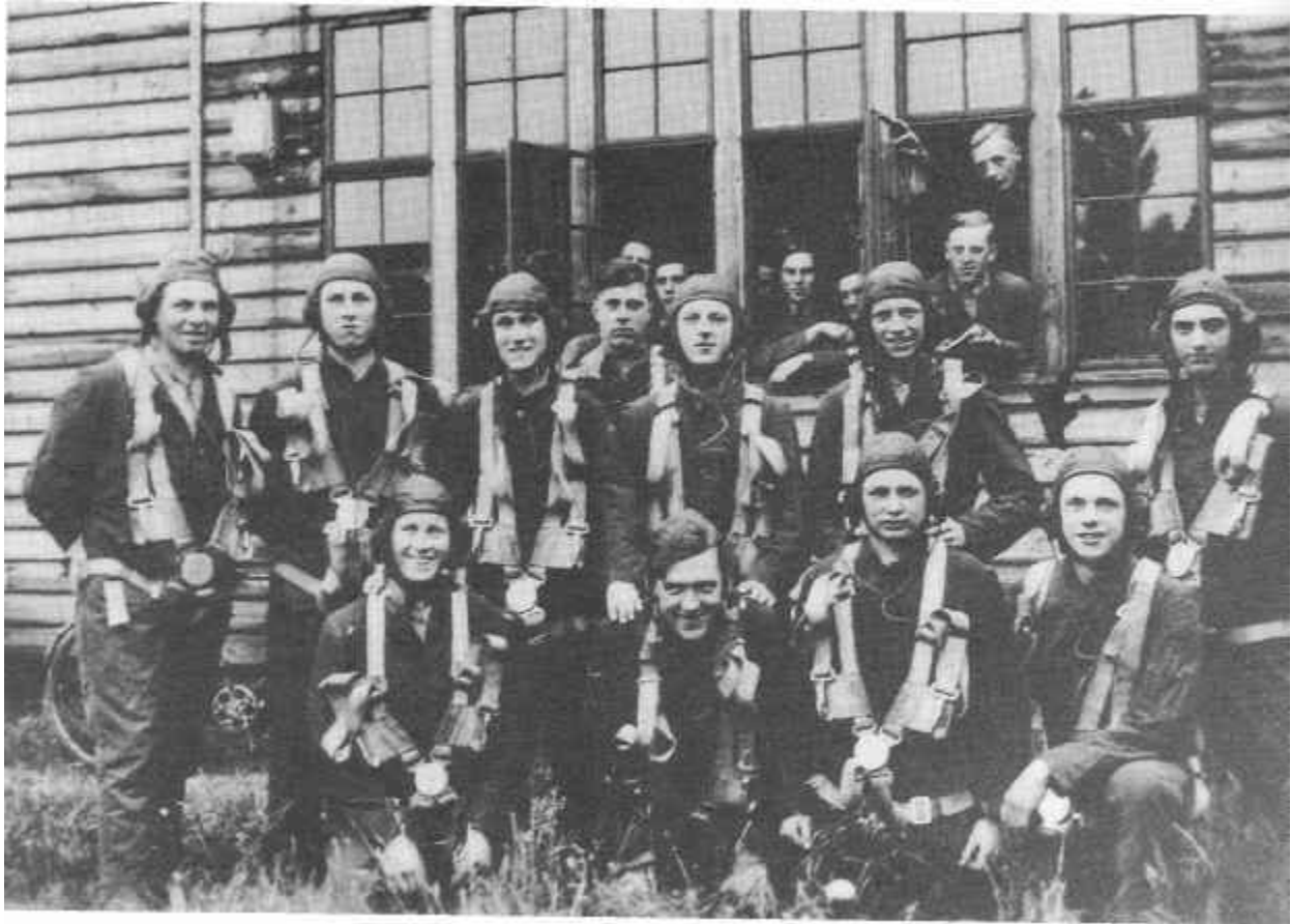
Class of 7B9—Initial flying training, 1937. Only two airmen of this group survived the war. The airman kneeling on the left and the author kneeling on the right.

A German police officer arrived and demanded in broken English details of my aircraft and crew. I refused to answer. He then hit me across both sides of the head and with his pistol pressed against my stomach made further threats. Not getting any answer, he pushed me into a chair and said, "What does it matter. We shoot you in the morning anyway."