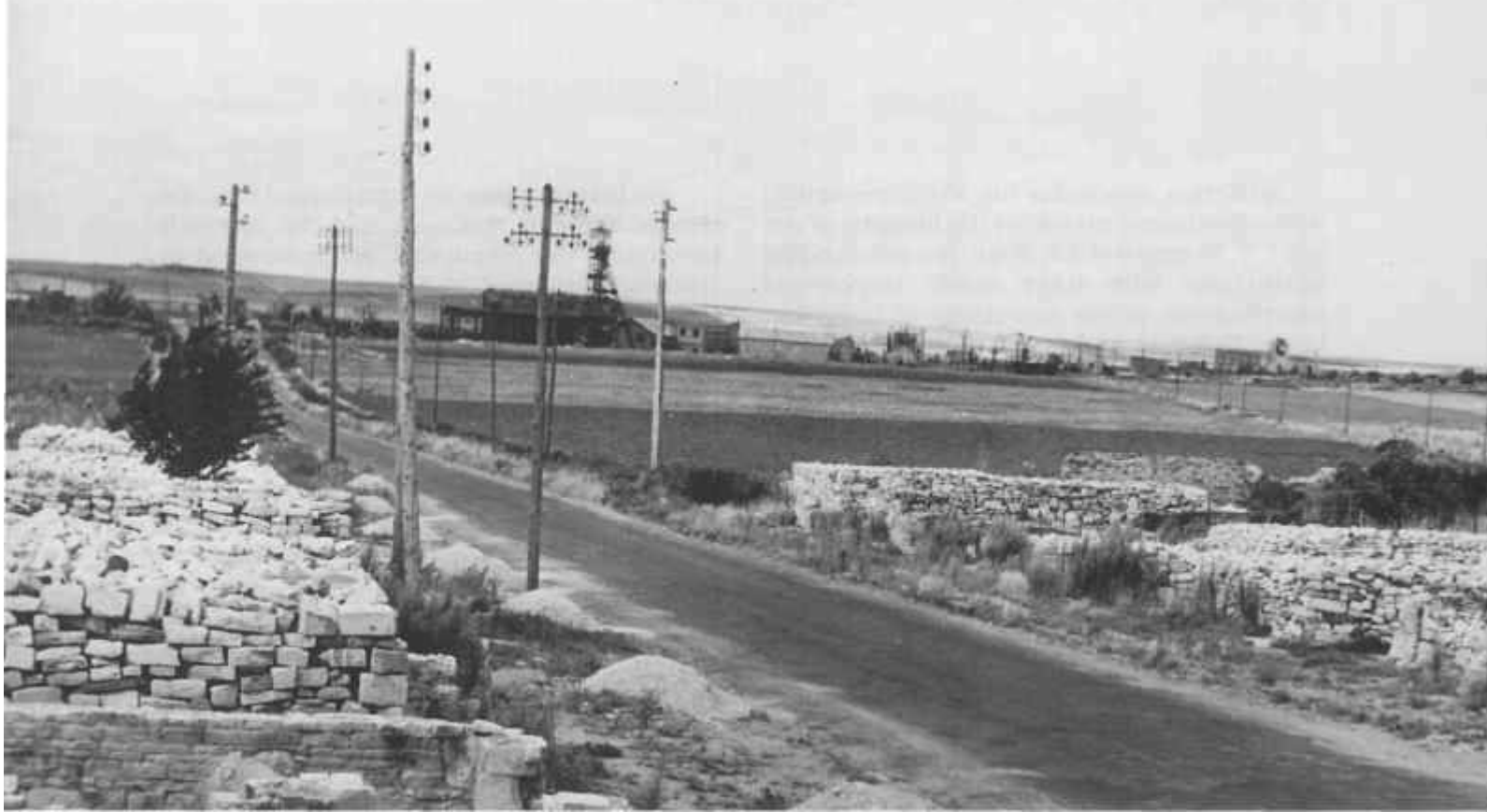
The mine tower in the "factory" area is visible in this photo taken from the north edge of May-sur-Orne looking north. The high ground in the background is Point 67. The low, square tower on the right is the church in St. Martin-de-Fontenay. This photo was taken in 1946.

carry on." 13 On top of the ridge the remnant of the battalion "ran directly into a strong and exceptionally well camouflaged enemy position." 14 Tanks and self-propelled guns were concealed in haystacks and intense close-range fire forced the men to ground. Griffin, who may have been the only officer left, ordered a withdrawal - "every man to make his way back as best he could." Not more than 15 soldiers were able to do so. Griffin's body was later found "lying among those of his men." 15