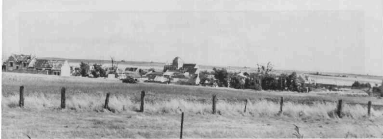
This photo shows the gentle slope of Verrieres Ridge, visible in the distance past the town of St. Martin-de-Fontenay.

aside from the three serious losses in leadership, were slight, amounting to ten or fifteen altogether.'