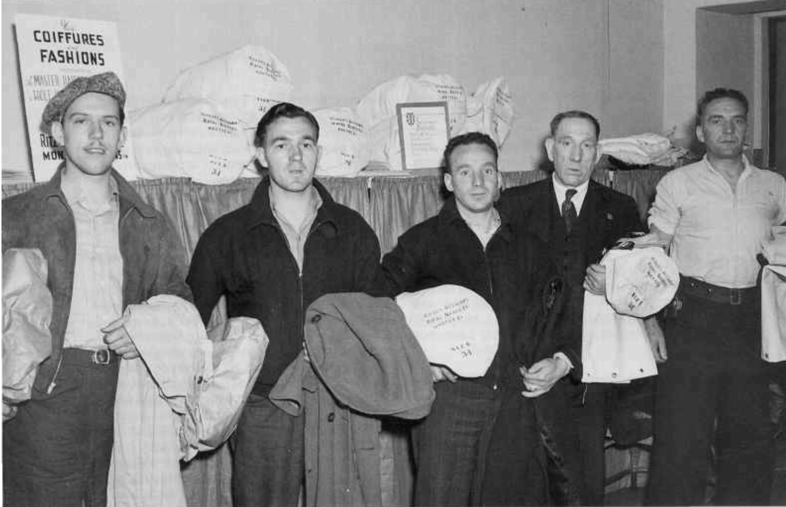
Sailors from a merchant ship torpedoed in the Gulf of St. Lawrence are provided with "survivor's bundles" by the Women's Naval Auxiliary Services, May 1942.

effective and U-553 was unable to make any further attacks on shipping.