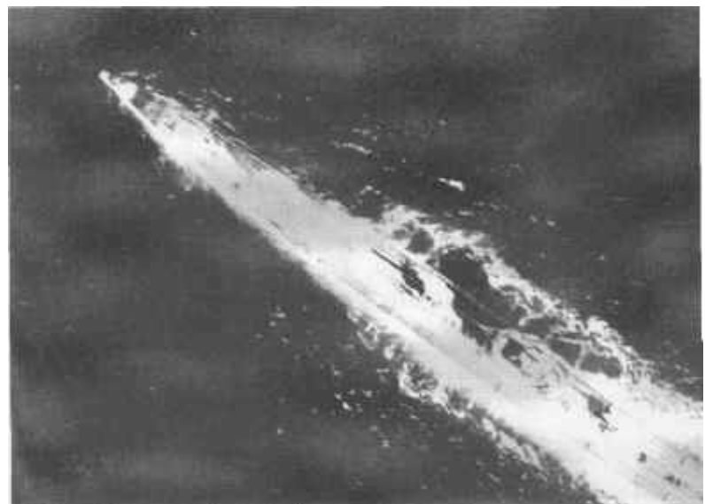
This photo was taken from a Lockheed Hudson of 113 (Br) Squadron during an attack on U-165 on 9 September 1942 just south of Anticosti Island.