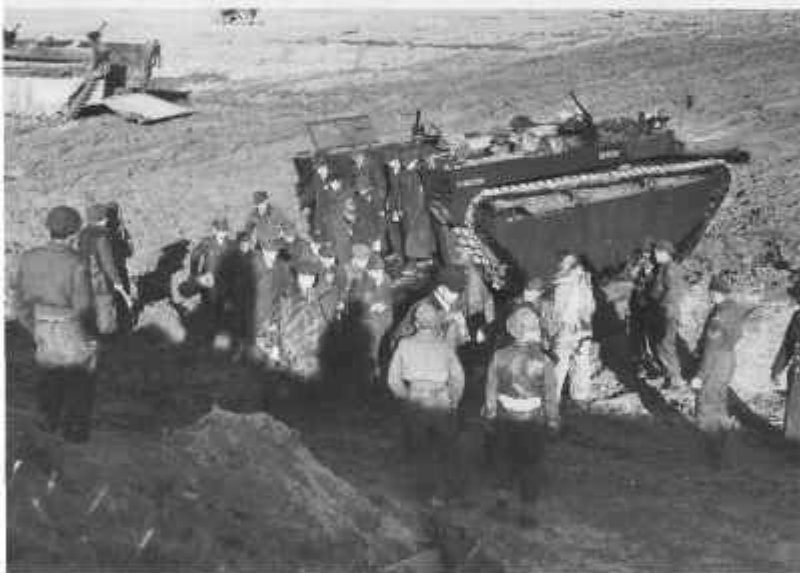
NAC PA 137239