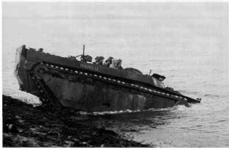
Canadian Army Photo 41339-N