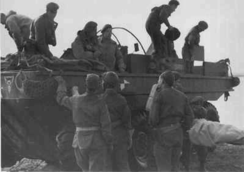
NAC PA 136822

approximately 240 tons of ammunition, 60 tons of petrol, derv, FTF (H) C02 bottles and oil, and 100 tons of supplies, water, blankets, stretchers and signal equipment.