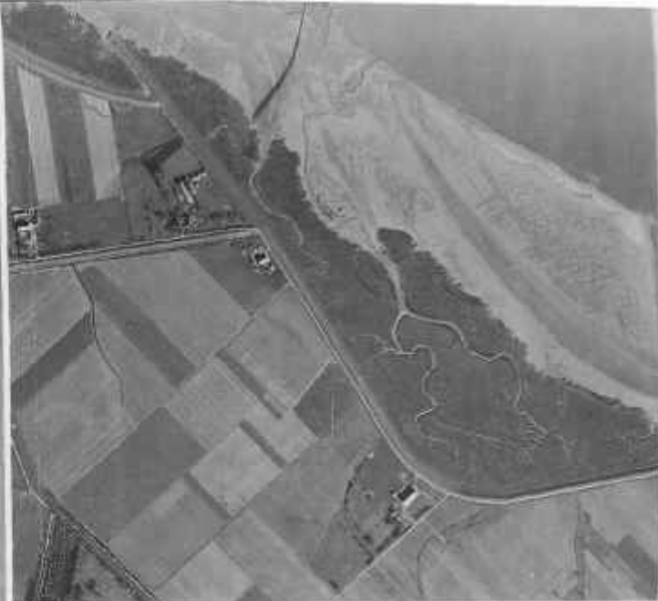
Green Beach (left) and Amber Beach (above) photographed on 6 October 1944, the day prior to the landings by 9 Canadian Infantry Brigade.