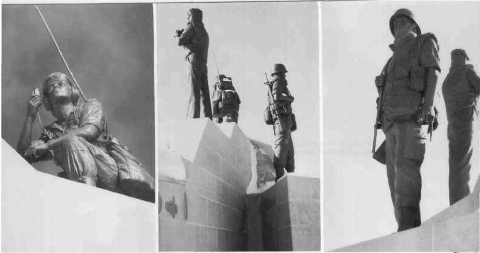
Figure 7, 8, 9 - Views of the three statues on the Peacekeeping Monument by sculptor Jack K. Harman.

complexity of the monument echo the ambiguities and complexities of the very act of peacekeeping and of peace itself? Further evidence of a lack of a unifying style is the 'peace grove,' which remains a visual sideshow.