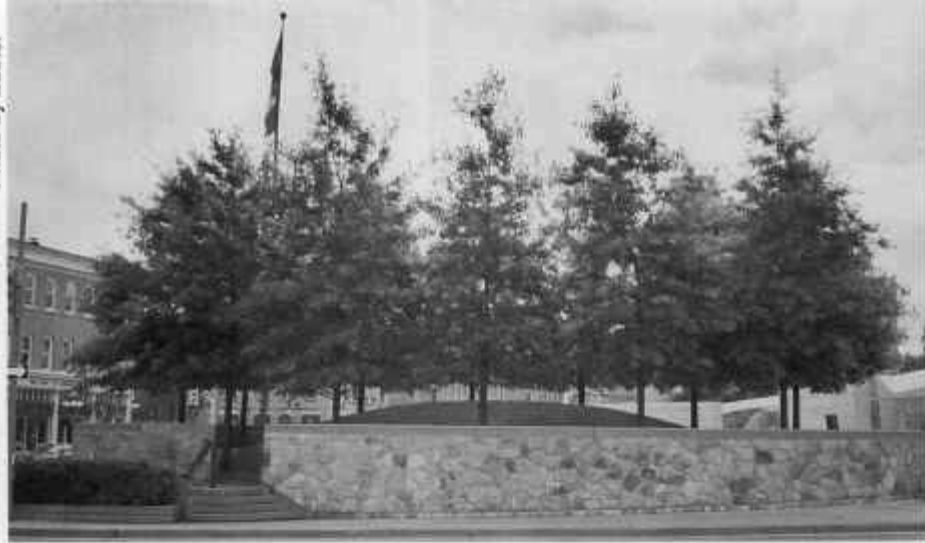
Figure 5 - Peace Grove Peacekeeping Monument, Ottawa