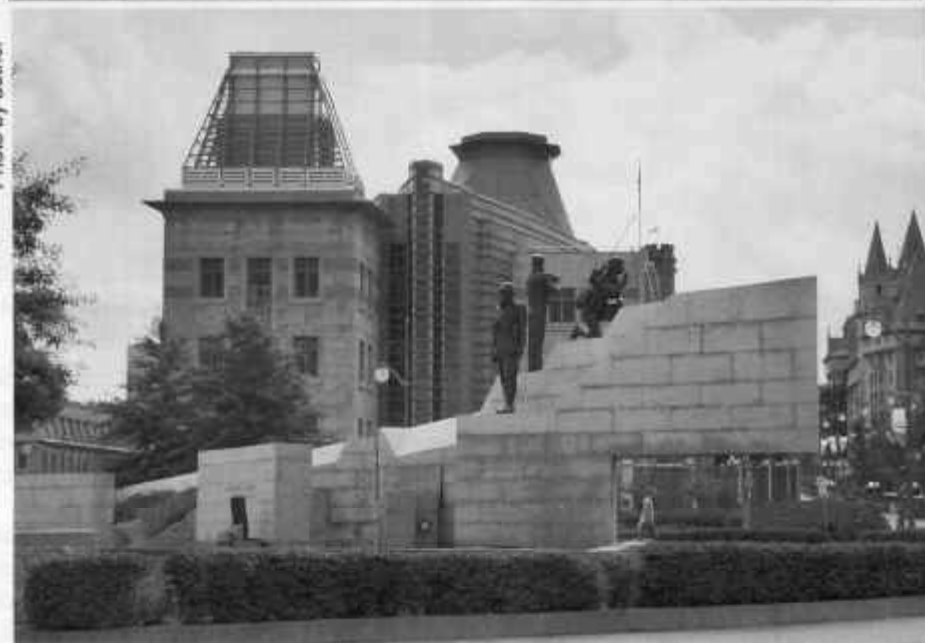
Figure 6 - Peacekeeping Monument with US Embassy building in background.

Despite the sense of enclosure, there is little relief from the noise of passing traffic. As an emblem, the monument is a little overwhelmed by the two adjacent post-modern structures: the glass tower of the National Gallery to the north and the unwelcoming glazed exterior of the US Embassy some 50 metres to the south (Figure 6). Surrounded by these new buildings the monument does not quite dominate the urban room for which it was intended.