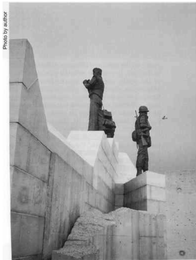
Figure 2 - General view of the Peacekeeping Monument, Ottawa.

As dramaturgical space the monument has considerable impact. The corridor is best viewed from the south-east, where the eye is drawn into the cleft by a pattern of floor tiles (modelled on the Green Line bisecting Nicosia, the capital of Cyprus) that meander around the chunks of sawn and drilled concrete littering the corridor floor (Figure 3). Approaching the apex of the two walls that form the sides of the corridor one becomes aware of the large cast bronze figures dominating the skyline. Two fissures in the corridor walls open out to reveal the ceremonial