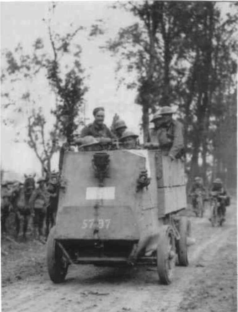
NAC PA 3015