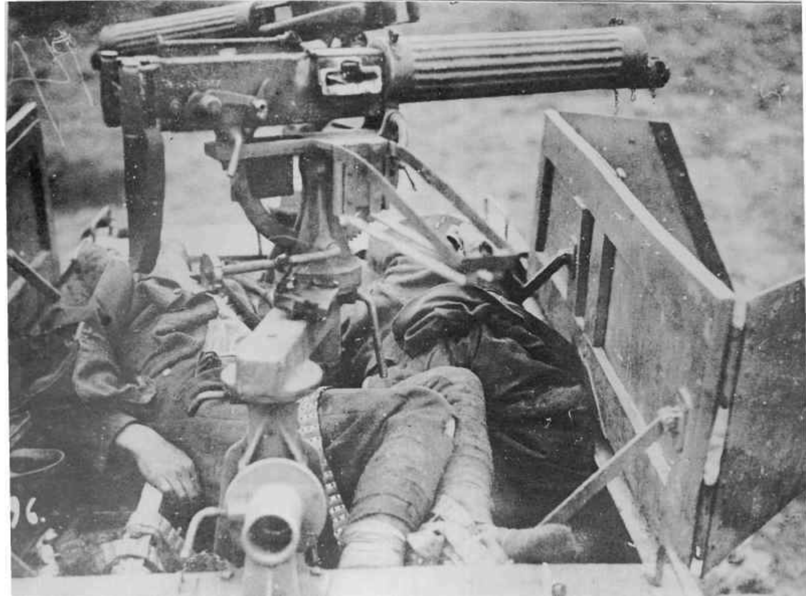
Photograph No.3 - The last of the three German photographs taken with the photographer standing in the car's cab and looking backwards along the rear.