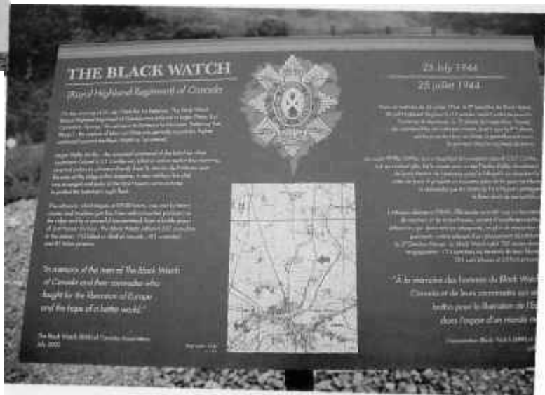
The Black Watch plaque with a map of the battalion's role in Operation "Spring." The map is oriented to the south in the direction of the attack.