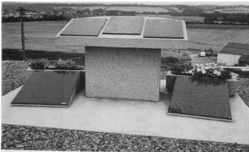
The Toronto Scottish Regiment Memorial at Point 67. The view is to the west over the Orne River Valley.

It is the hope of the Foundation that other units of the Canadian Army will place plaques at the Point 67 and St. Lambert-sur-Dives viewing areas to honour their roles in the battles of Verrieres Ridge and the closing of the Falaise gap-