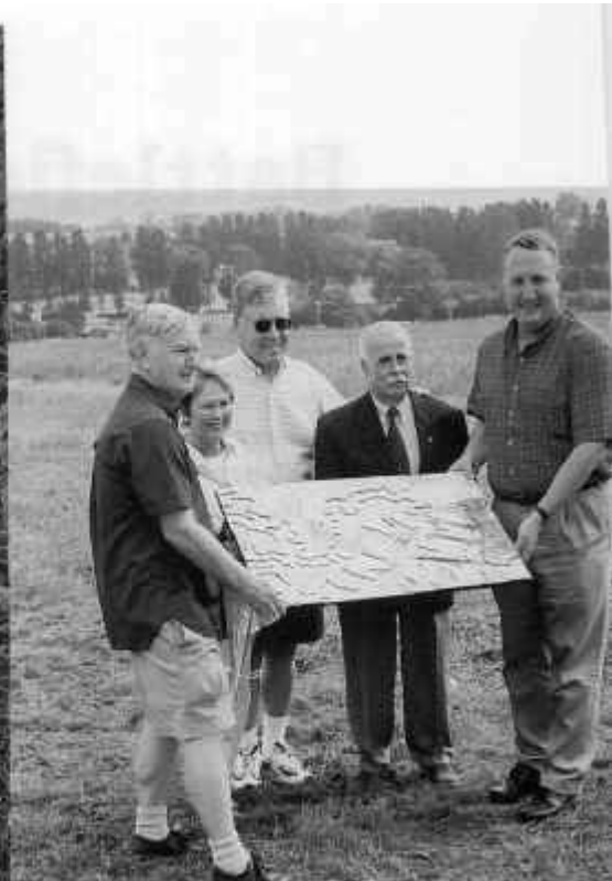
Above left: The three-dimensional map of the Trun-Chambois gap oriented to the east to conform with the view of the battlefield. Canadian, Polish, American and French forces are indicated, as well as the escape routes of the German army.