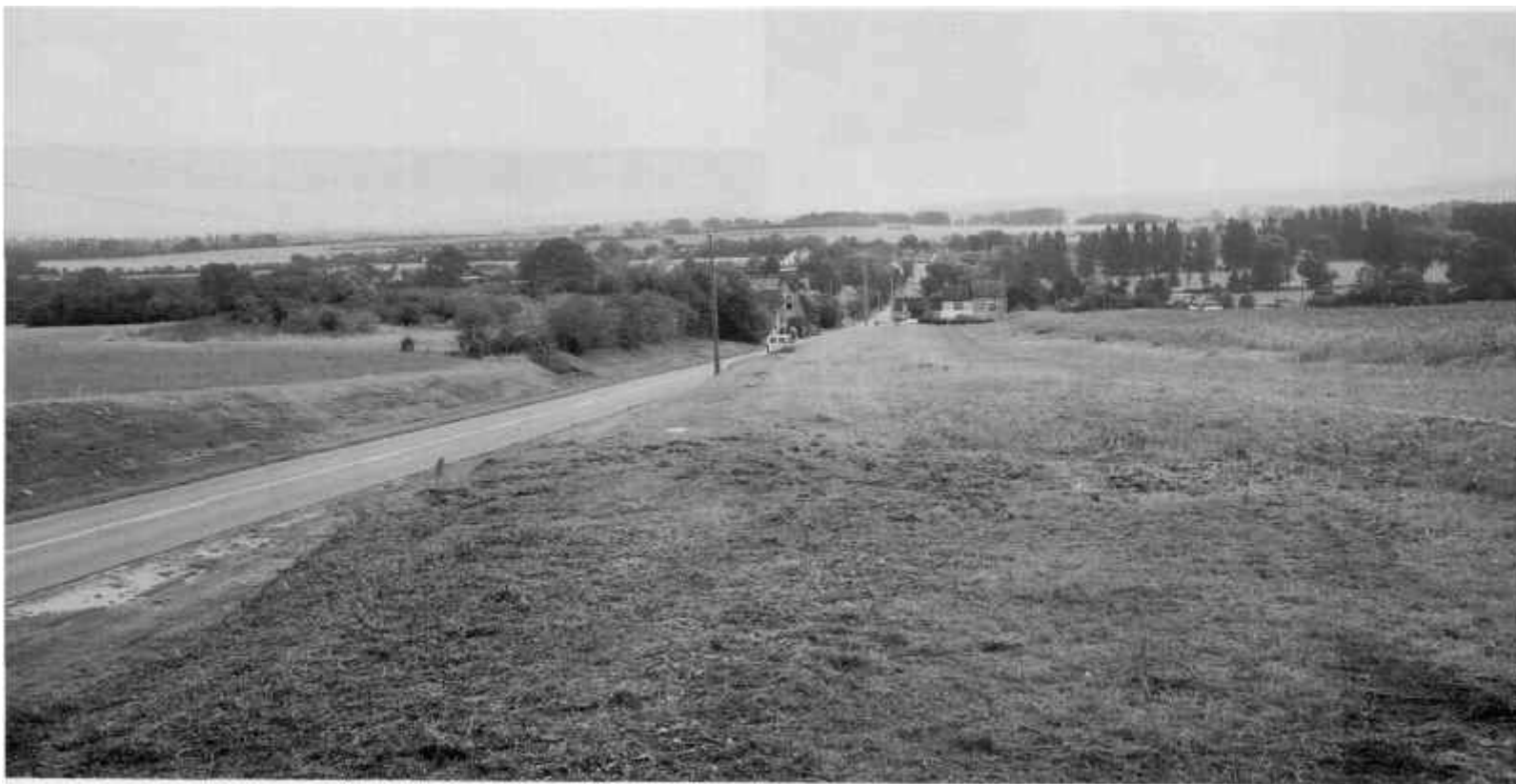
The view from the St. Lambert-sur-Dives "Belvedere," overlooking the spot where Major David Currie won his Victoria Cross.