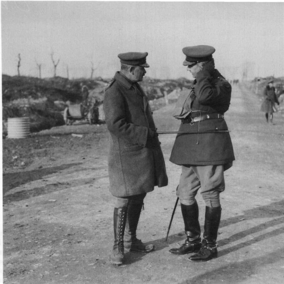
General Sir Julien Byng talking to Lieutenant-General Arthur Currie, February 1918.

In France was very high." 4 Why have Byng's and Currie's commanders, with rare exceptions, not been studied? Perhaps, as Arthur Lower concluded, Canadians "became intensely proud of their fighting men, though characteristically they took little interest in their generals." 5 Unfortunately, this disinterest has also extended to Canada's military historians. 6