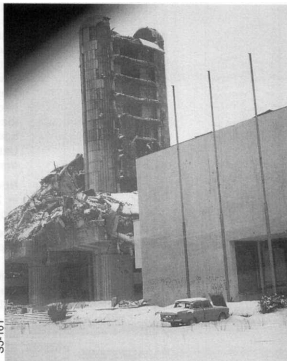
Then (right): This is the Oslobođenje which was the press and newspaper tower. It was destroyed by shellfire in the summer of 1992 and is perhaps the most famous building of the Bosnian conflict and the Siege of Sarajevo. Despite the destruction of the building, the presses in the basement still produced a daily newspaper which was distributed throughout the city. Now (far right): Still standing in February 2001, only the wrecked car has been removed and a fence erected around the Oslobođenje to keep out the curious. Rumours are that this tower will not be repaired or torn down, but left as a lasting symbol of the war.