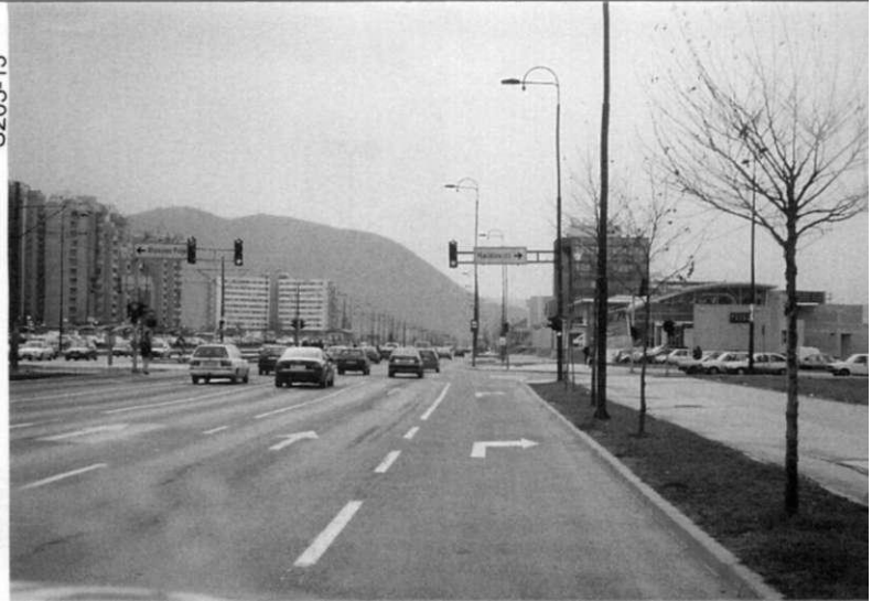
Then (above left): The Sarajevo PPT Inzenjering or Postal, Telephone and Television (PTT) Building on Bulevar Mese Selimovica was used by the UN as its Headquarters in Bosnia. Note the tetrahedrons blocking the left-hand lanes of this major thoroughfare and the non-functioning traffic lights. In the background to the left can be seen the Studentski Dom. This building was used to hold foreign students who remained in the city when the war began. The students eventually had to be evacuated to safer locations when the building sustained severe damage from shelling. Now (above right): The tetrahedrons are gone and the traffic lights work. UNPROFOR has moved out of the PTT Building and a German Audi car dealership has been built in the lot just in front of the PTT. The Studentski Dom in the background, has been repaired and is now the headquarters of the UN and its various agencies in Bosnia.