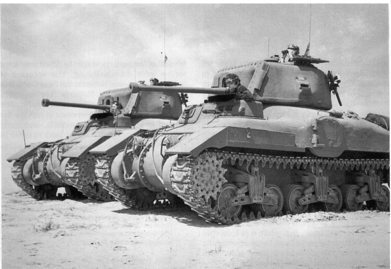
Two Ram tanks on a firing range in England.

easier and better production, as opposed to minor changes for tactical improvement. 60