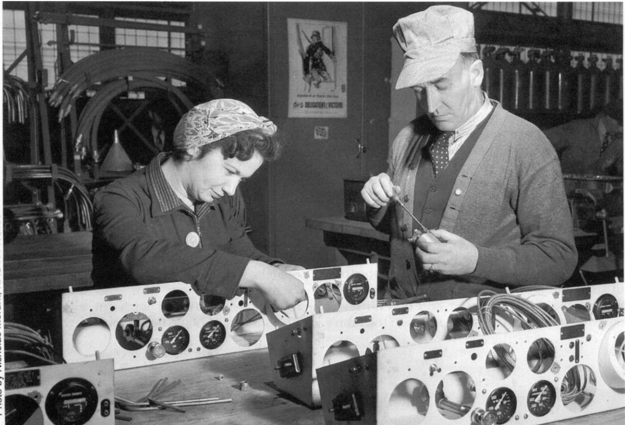
Male and female workers assemble instrument panels for Ram tanks at the Montreal Locomotive Works Plant, 1942.

As early as August 1942, however, A.G.L. McNaughton, commander of the First Canadian Army, had decided that standardization of tank forces and production on a North American basis should be achieved as quickly as possible, and that the M-4 Sherman, by then rolling off American assembly lines in huge numbers, would be the tank of choice. 36 Nevertheless, the army had compelling reasons to continue Ram production in the short term. McNaughton had publicly declared that the Canadian Army in England was a "dagger pointed at the heart of Berlin" 37 but the fact of the matter was very different. The same month, Brigadier R.A. Wyman, commanding officer of the 1st Canadian Tank Brigade, complained bitterly: