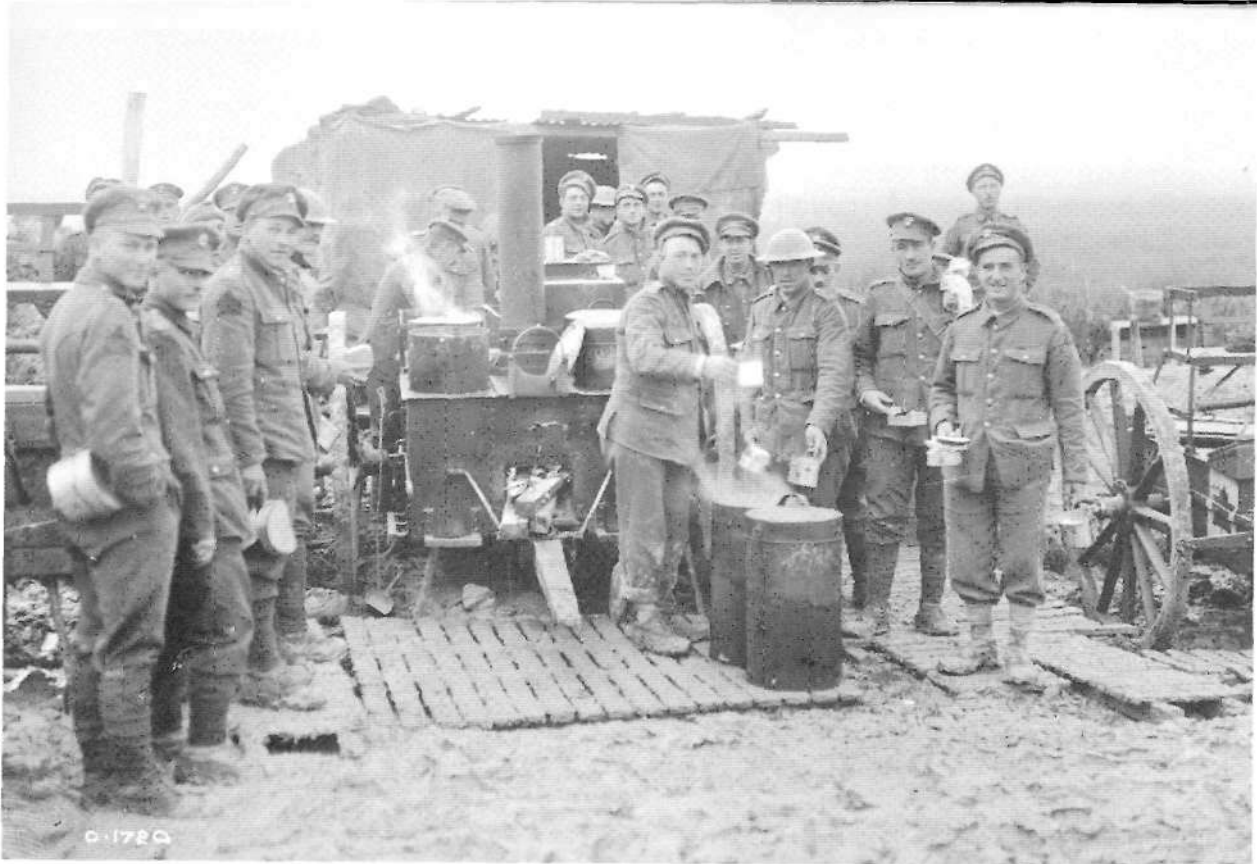
Men of the 87th Battalion receive their mid-day ration within a shelled area, August 1917.

But it is easy to imagine that any man regardless of his views on temperance would take comfort in an officially administered drink under such horrendous conditions. 24