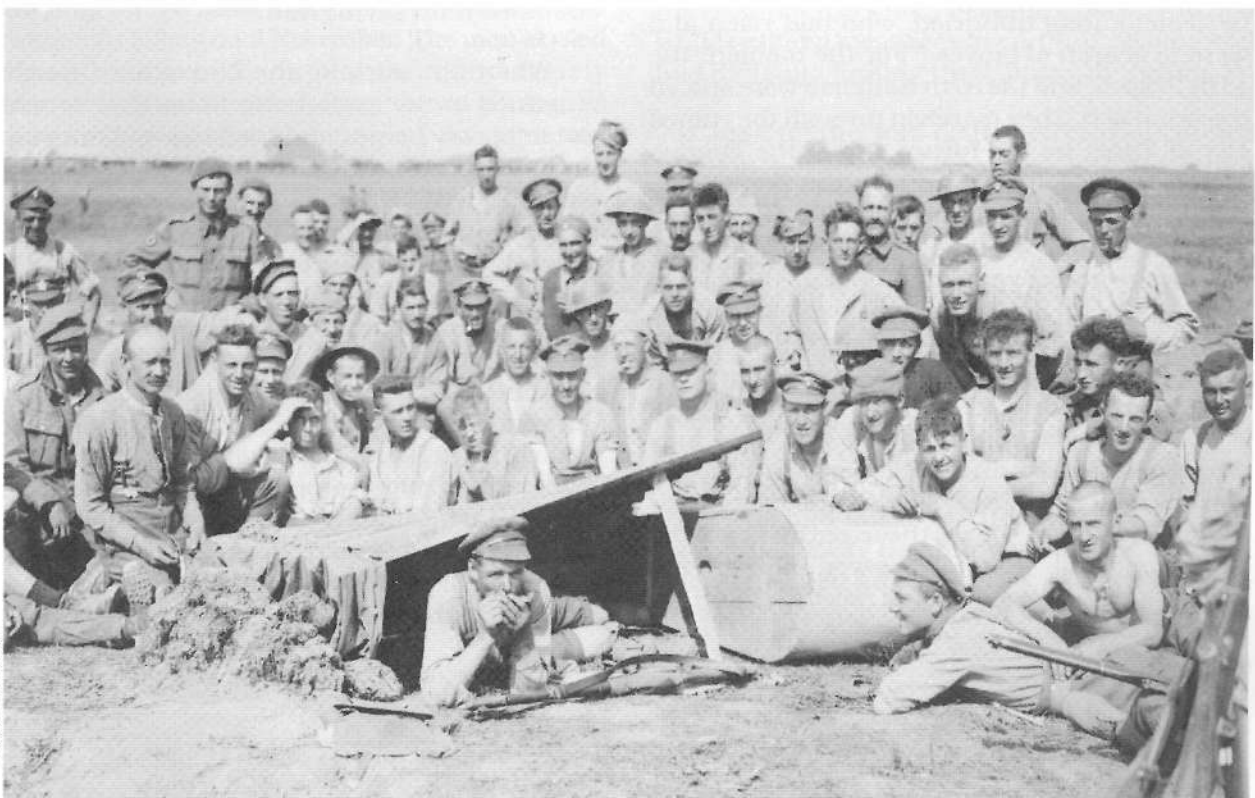
Men of the 87th Battalion listen to a comrade playing a mouth organ.

Bodies and bits of bodies, and clots of blood, and green metallic looking slime, made by explosive gases, were floating on the surface of the water below the crater banks...Our men lived there and died there within a few yards of the