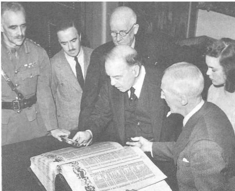
NAC PA 51570

The results of these endeavors were not inconsequential; in addition to settling battle honours and designing the Memorial Chamber, the Section had, by 1929, sorted and indexed 135 tons of records, indexed over 7,000