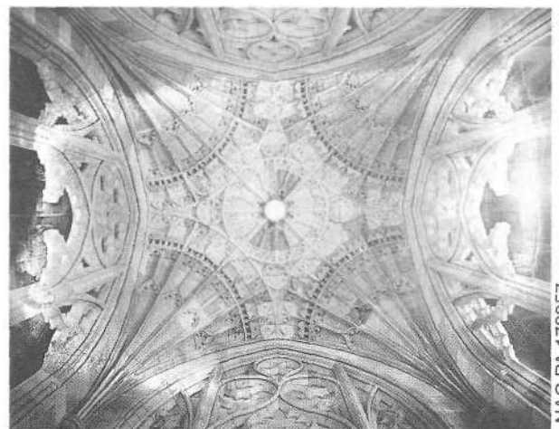
NAC PA 179357