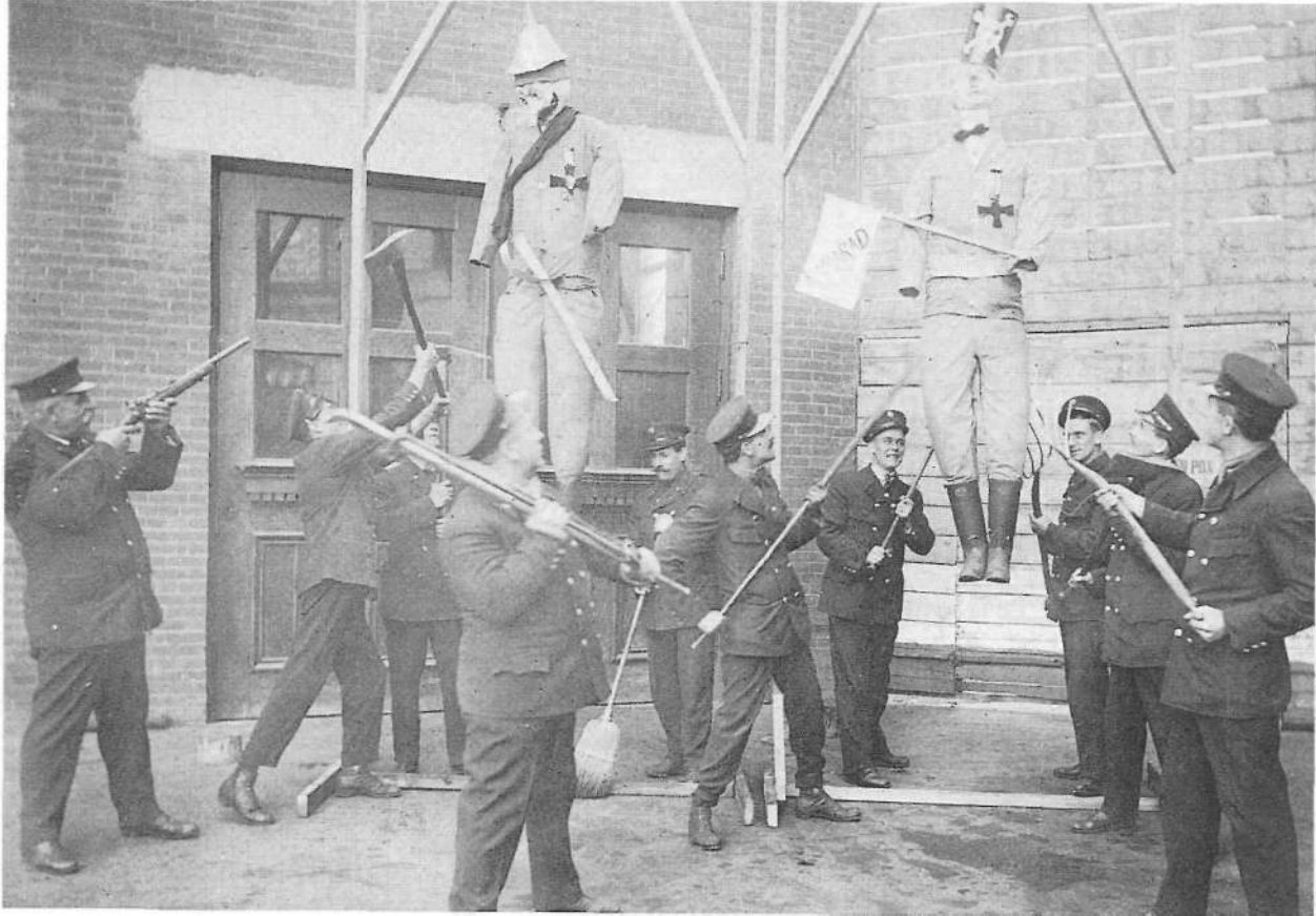
In this staged photograph, Calgary firemen attack effigies of German soldiers.