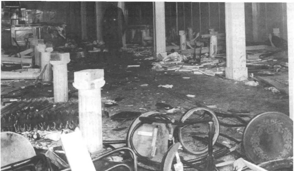
Post-riot photo of the White Lunch Restaurant.