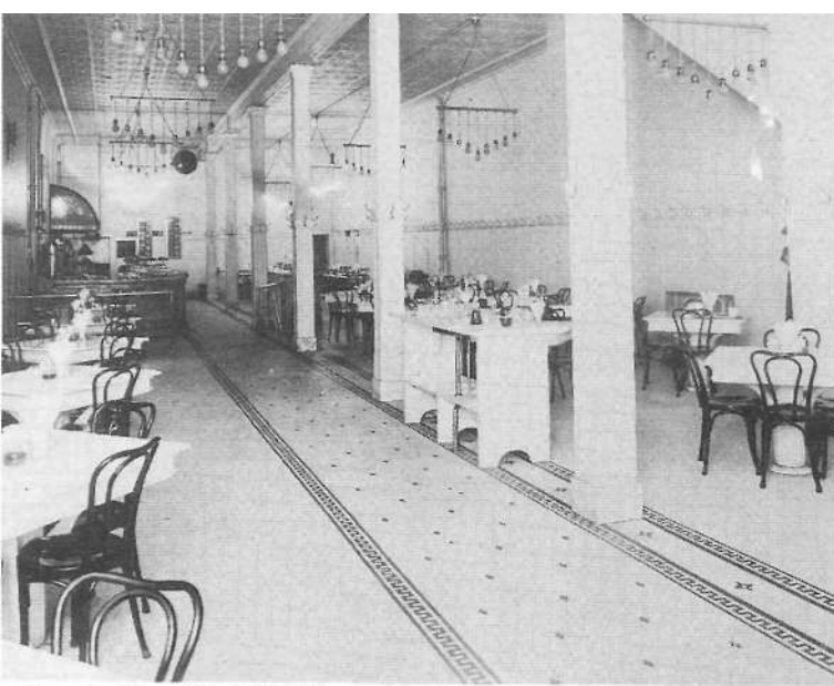
Glenbow Archives NA-1469-51