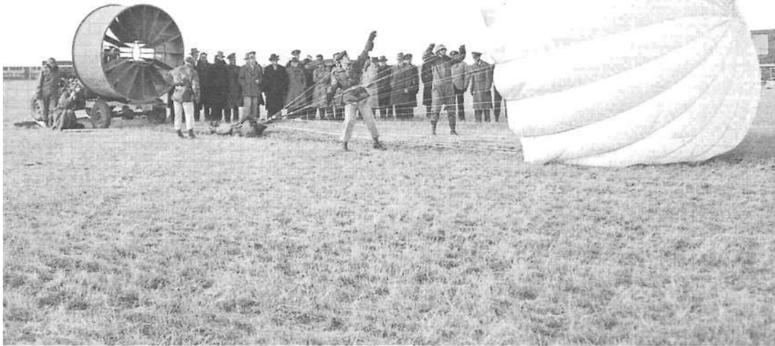
SAS Company paratroopers providing a "wind machine" training demonstration at the Joint Air School, Rivers, Manitoba, January-February 1948.

represent the nation's ready sword. They afforded a conceivably viable means to combat any hostile intrusion to the North. Better still, they would be incredibly cheap, if they were maintained simply as a 'paper tiger.'