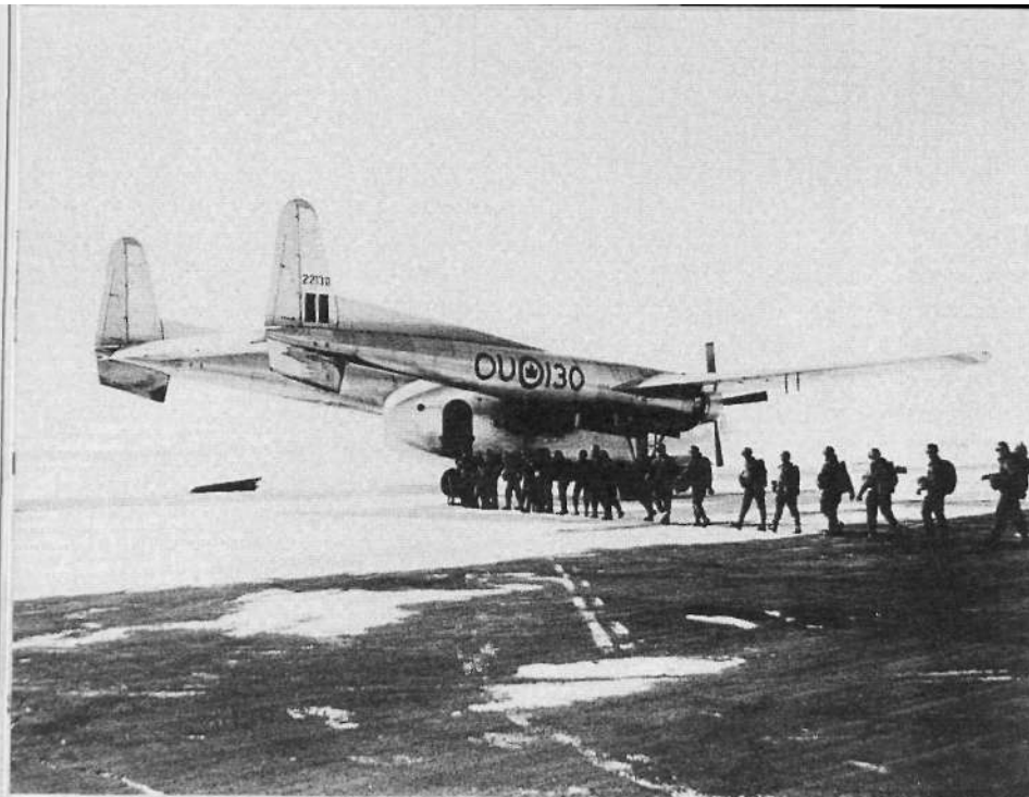
SAS Company paratroopers loading a C-119 Boxcar aircraft (left) and the subsequent para-drop (below left).