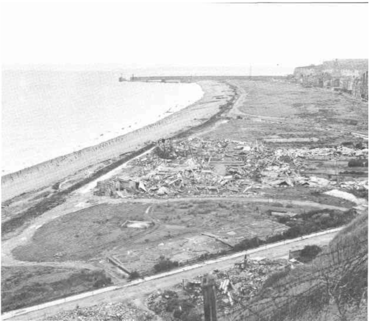
Above: Looking north from the top of the cliffs showing the commanding view possessed by the defenders. The ruins of the Casino are in the foreground. (NAC PA 136022)